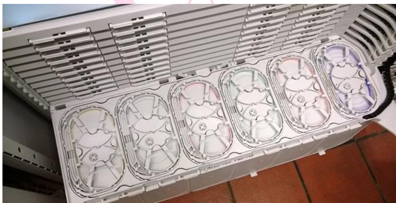
Optical Consolidation Rack: The trays wrap the individual fibres.

Read more at: www.connectingshropshire.co.uk/2015/01/fibre-fact-finding-expedition-2/