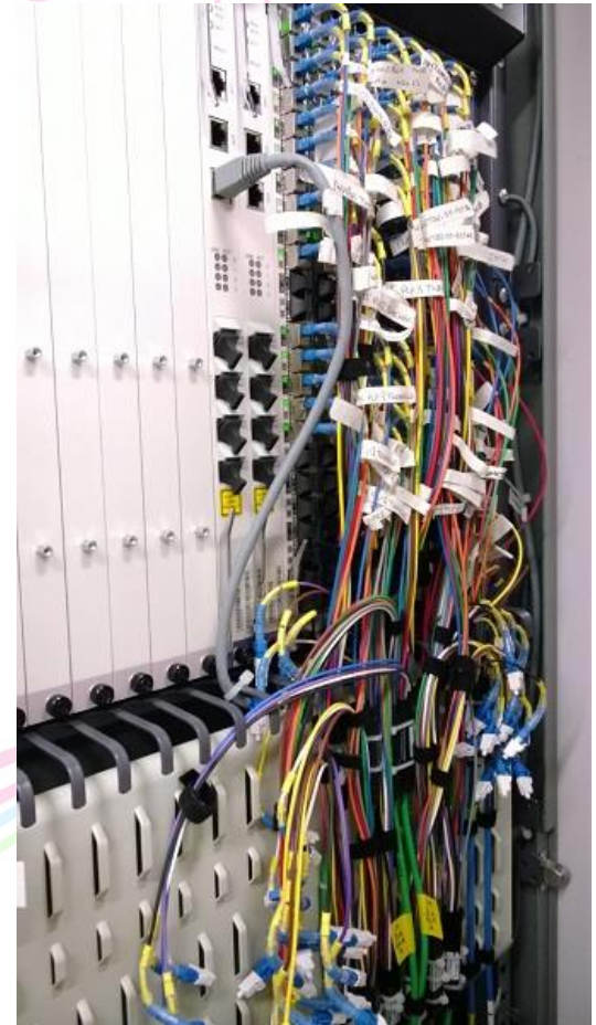
Optical Line Termination

The very start of the fibre optic journey is here, in the intriguingly named Optical Line Termination (or OLT to its friends). Fibre cables are attached to individual connecting points – or ports – here, each flashing merrily away if they are fully operational, before stretching out and into another, similarly large, cabinet called the Optical Consolidation Rack (OCR).