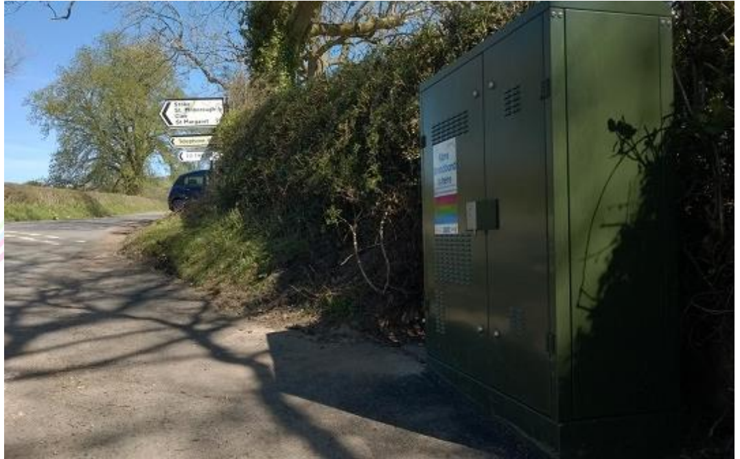
Fibre broadband is now available to homes and businesses in Stoke St Milborough

All premises in the programme area should benefit, either by having access to fibre based broadband, or from the availability of improved broadband speeds over alternative broadband technologies. All premises in the Connecting Shropshire programme area will be given access to a basic level of broadband (a minimum of 2Mbps) by the end of the programme.