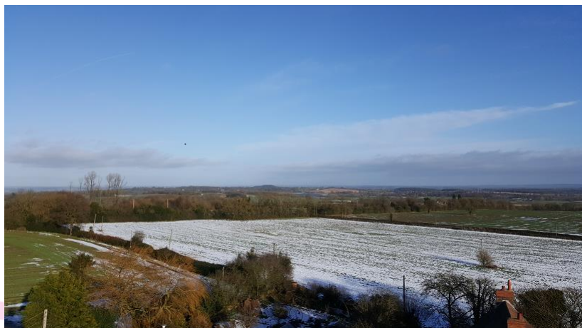
Airband transmitters are located to have a far-reaching view to provide access to superfast broadband to as many properties as possible.

Airband's deployment of fixed wireless broadband works by sending a radio signal from a transmitter site to a small receiver attached to the property. A cable is then run into the building allowing the end-user to access the internet in the same way as other broadband connections. To read the full story, go to: http://shropshire.gov.uk/news/2018/01/superfast-broadband-rollout/