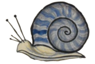
Snail from The Rutland Psalter, c. 1260

In Shropshire, they found themselves plunged back into the dark ages that Matthew writes about: "Forsooth, broadbände was slower thann ye olde snailes".